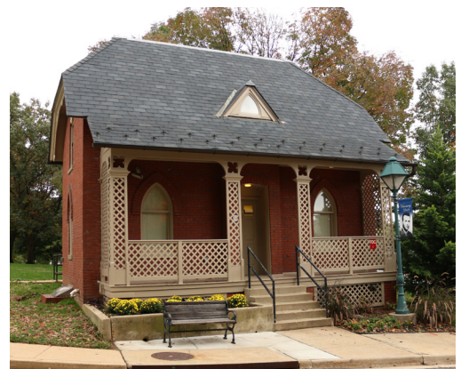
Painting completed.