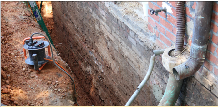
Barriers were set up around the Gate House to prevent anyone falling into the ground areas dugged out to repair the basement from leaks.

During the last few weeks of August and the beginning of September, the Museum Staff found it difficult to focus on our work here at the Gate House. This was due in fact to the very necessary construction and repair work being done around the foundation of the Gate House. Leaks had appeared in the basement, and therefore something needed to be done. For three weeks the crew dug up the ground around the Gate House, repaired the foundation, and filled it back in. During this time, the Museum Staff got a fascinating look at how the foundation was constructed. To our surprise, the outside of the foundation was lined with