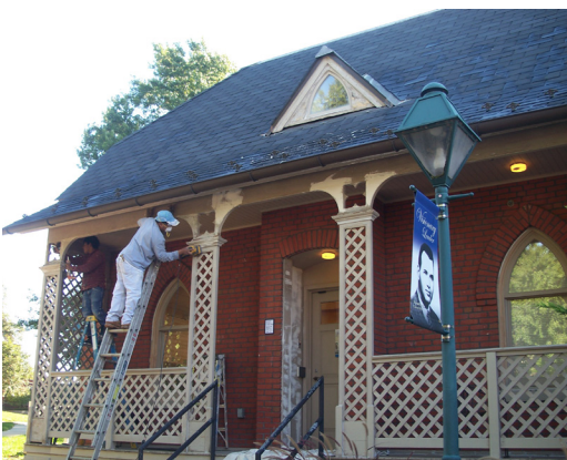
Painters at work on the Gate House.

2014 – October, the Gate House receives a fresh coat of paint in preparation for the winter.