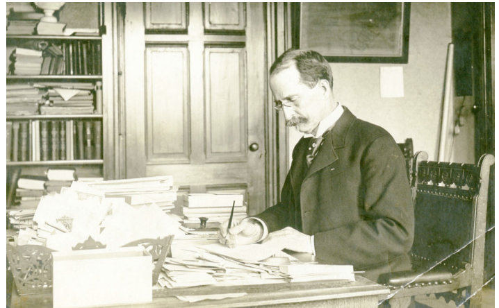
President Edward Miner Gallaudet, circa 1907.