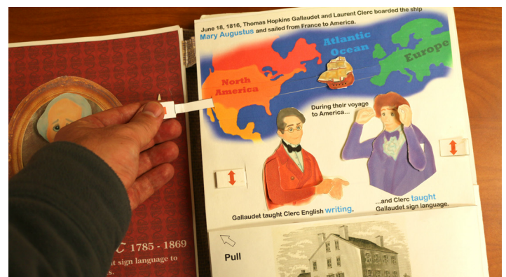
You can pull a ship across the ocean in this book.

It took Brooks approximately two years to create 30 copies of handcrafted pop-up books. It starts with conceptualizing the contents of the book, its storyline, and how to innovate pop-up or paper "animation"