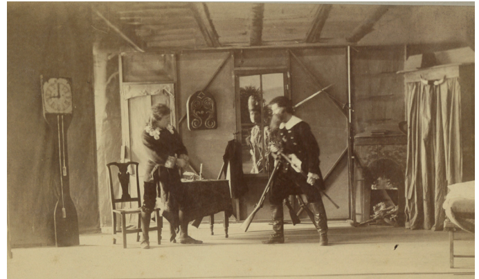
Courtship of Miles Standish , February 7, 1890.

One of the most exciting references I came across for the chapel was an account written by an Introductory Student on her first full day on campus. After breakfast in the dining room, she proceeded to the chapel, preferring to stay indoors on a rainy day. She thought the descriptions she had heard ("magnificently grand and imposing") were a bit overkill, but thought it was "spacious and airy". She also described what was occurring in the room at the time. She commented on the presence of many gentlemen in the room, some with full mustaches, others with no facial hair. It appears the chapel was used as a place to relax and hang out when not used for events; a common area. If you would like to read her impressions in full (including her initial thoughts on the college life, and what a boy's room looks like), check out the December 19, 1894 edition of the Buff and Blue , page 16, (con't page 4)