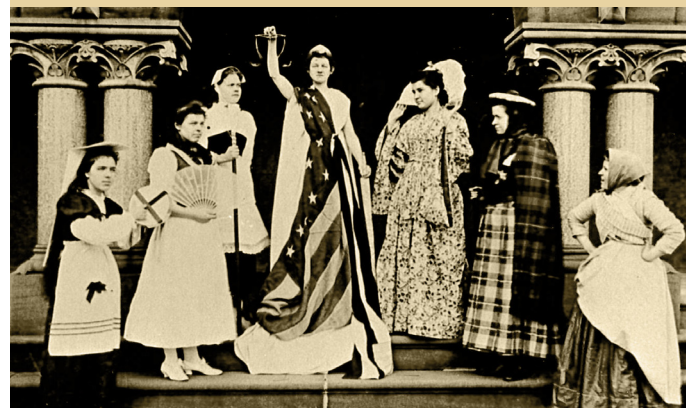
The Nation Pays Homage to Justice .