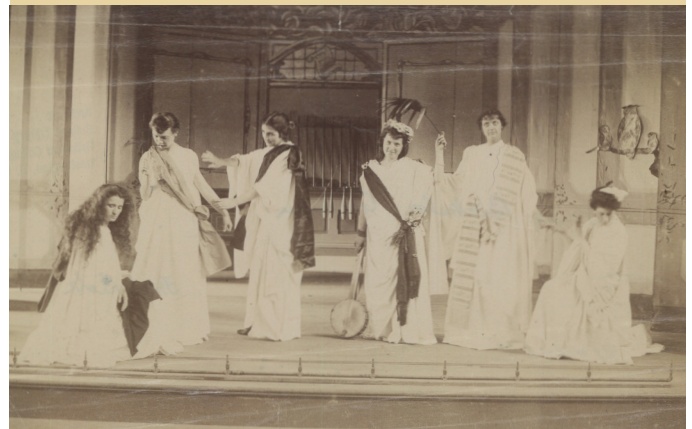
Performance by O.W.L.S., ca. 1890s.