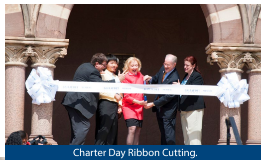
Charter Day Ribbon Cutting.