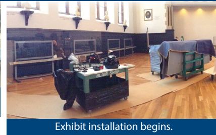
Exhibit installation begins.

Click to shop for a holiday gift from the Museum Store.