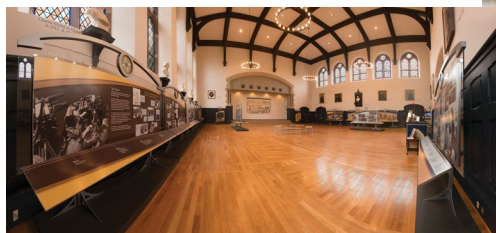
A Panoramic view of the new exhibit.