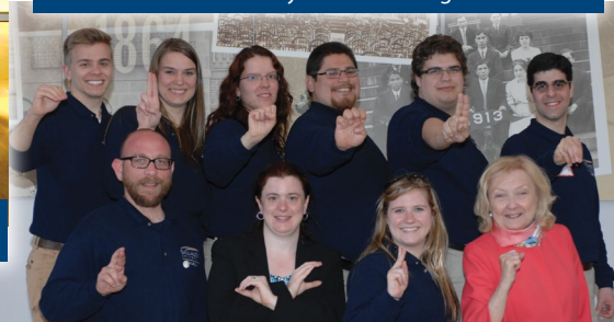
Museum staff on Opening Day.