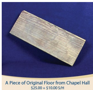
A Piece of Original Floor from Chapel Hall $25.00 + $10.00 S/H

Click to shop for a holiday gift from the Museum Store.