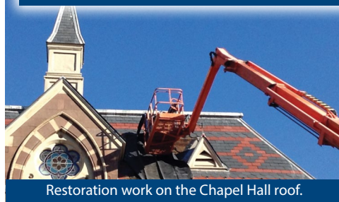
Restoration work on the Chapel Hall roof.