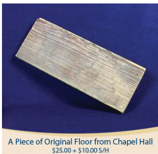
A Piece of Original Floor from Chapel Hall $25.00 + $10.00 S/H