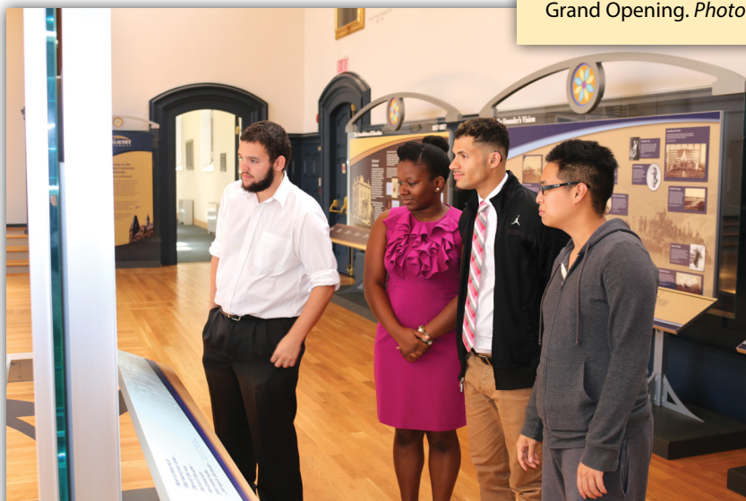
Gallaudet University students enjoy browsing the exhibit.