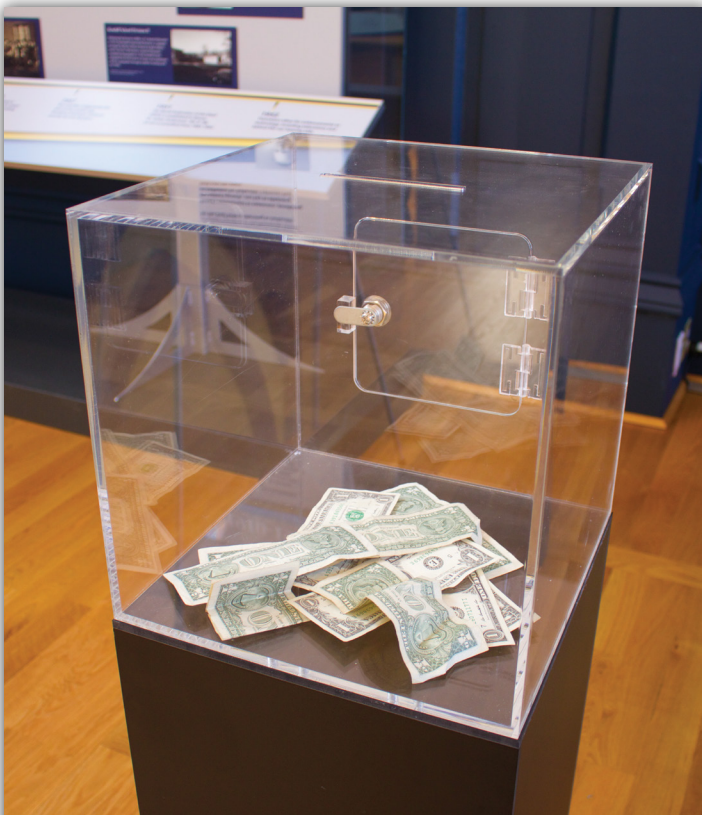
The donation box stands ready to collect your donations!

In celebration of the Museum's first anniversary of the Chapel Hall exhibit, we will be having a Dollar Donation Drive ! How do you participate? It's easy! Simply come and visit the Museum the week of April 6th-April 10th, and donate a dollar or more to help the Museum! We will be announcing any donations gathered during the week in the box, and hopefully we will even have to relieve an overflowing box during this time. Help us fundraise, so we can focus on ongoing Museum operations including creating new exhibits and programs. The vast majority of our budget is supported by on your donations. If you are unable to participate in the Museum Dollar Drive in person, go online to https://giving.gallaudet.edu/museum to donate instead! A dollar per visitor goes a long way.