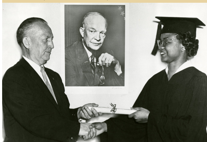
As First Black Deaf Woman Graduate, 1957