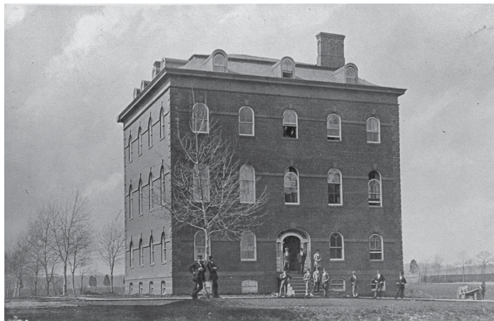
Newly completed Primary Dept. Bldg., ca. 1866 Looking westward.

Editor's note: The Time Capsule is the series of articles featuring the people and places of Gallaudet University's history.