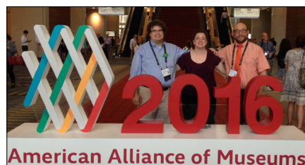
Museum Staff at the AAM Conference.

Networking with other museum professionals that share the same areas of focus as myself has been very rewarding; because of that I am able to help the Gallaudet Museum take bigger steps towards connecting with the community and people.