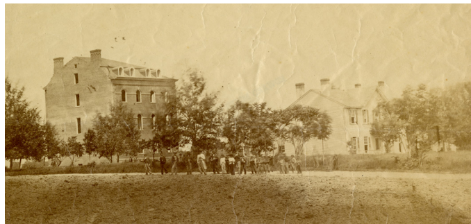
Unfinished College Building, ca. 1865. Looking towards the north-east, the Rose Cottage is seen in the foreground.