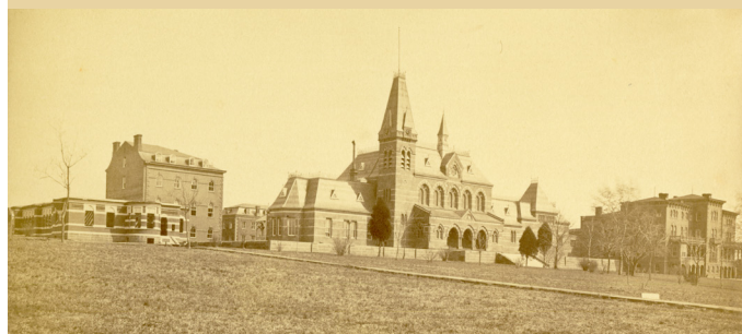
New College Hall being built, ca. 1874-75. College Hall under construction connecting to the East Wing.