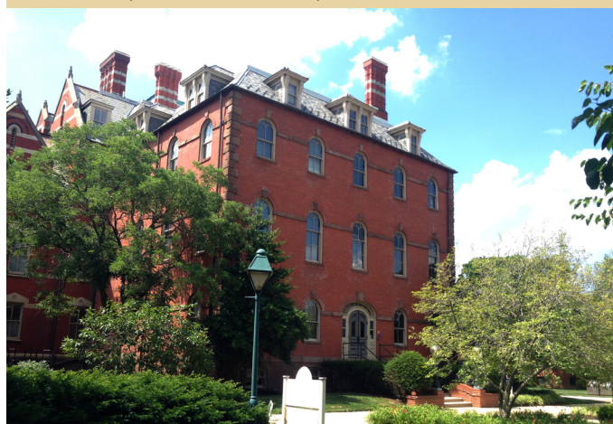
East Wing of College Hall today, 2016