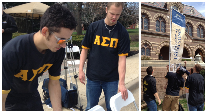
The Alpha Sigma Pi Fraternity helped the Gallaudet Museum prepare for the Grand Opening Ceremony.

During lunch the Alpha Sigma Pi Fraternity gave a much-needed assistance to start setting up chairs and banners for the grand opening. The Gallaudet Museum expresses appreciation for their help.