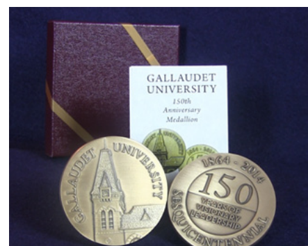
150th Anniversary Medallion $50.00 + $6.00 S/H