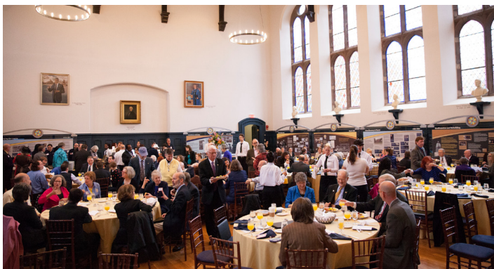
Inside Chapel Hall during the Charter Day Breakfast and Museum presentation.