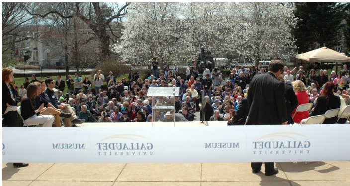
At the Chapel Hall front steps before the Grand Opening ceremony began.

April 8th, 2014, also known as Charter Day, was a very important day for Gallaudet University. Alumni, faculty, staff and students gathered from across the country to celebrate the sesquicentennial of the world's first university for Deaf students. The community gathered for group photos, lectures, laying of wreaths, and a tree planting. While all these different activities were occurring, the Museum staff prepared for the Grand Opening of the Gallaudet