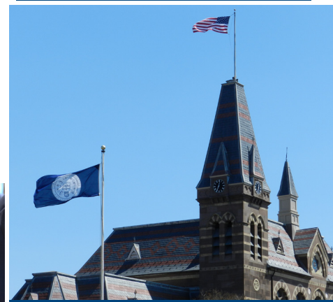
Many thanks to all who came to the Grand Opening on a beautiful Charter Day.

The Gallaudet University Museum publishes the Our Story newsletter bi-monthly. We welcome photographs and stories of historical significance relating to Gallaudet University and Deaf History.