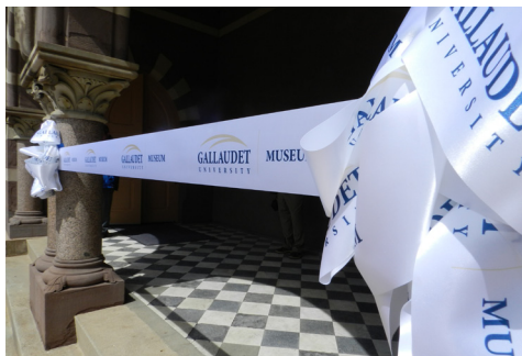
Grand Opening Ribbon.

Looking back on Charter Day, April 8, 2014 was a beautiful day when the Gallaudet at 150 and Beyond exhibition was officially opened during the Grand Opening Ceremony at the front steps of Chapel Hall.