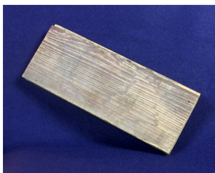
A Piece of Original Floor from Chapel Hall $25.00 + $10.00 S/H

All proceeds from the Gallaudet Museum online store go to the Gallaudet Museum Donations Fund . Questions? E-mail to museum@gallaudet.edu .