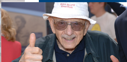
"Bummy" gave "thumbs-up" approval on the new Museum.