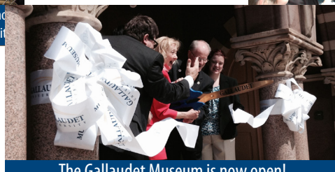
The Gallaudet Museum is now open!