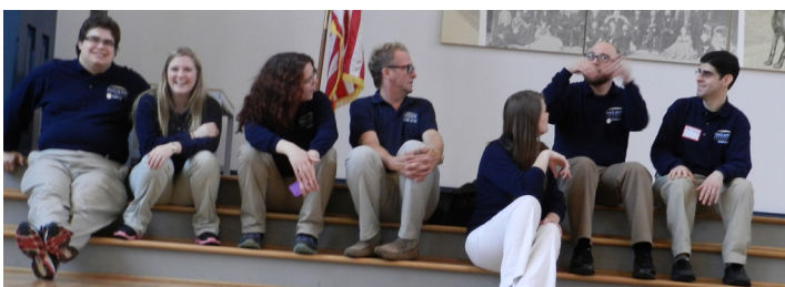
The Gallaudet Museum staff discusses and reflects on what had transpired on this historic day.

seeing all those people observing our months of hard work. It was also overwhelming, as just eleven museum staff members handled a total of over 1,000 visitors on our first day, with most of them visiting until 5:00pm. At that time, Alpha Sigma Pi members returned and, with the assistance of the museum staff's family members, took down all the chairs in