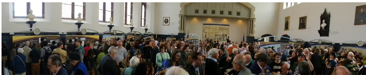
A little over 1,000 visitors came into a brand new museum shortly after the Grand Opening on Charter Day, April 8, 2014. There have been overwhelming numbers of positive comments about Gallaudet at 150 and Beyond exhibition and looking forward to more new rotating exhibitions in the future.

Future phases for the museum will include partnerships with various departments on campus, as well as public programs. We hope to offer a Deaf museum symposium sometime in the future, and we will develop a new exhibit for the Market place, to replace the existing “Deaf Peace Corps” exhibit which has resided there since 2011. In addition, we are working on possible topics to replace the current rotating exhibits on Andrew Foster and Then & Now sometime after January 2015. In order to ensure these goals, we ask that you continue to lend us your support, and donate to the museum today! You can also purchase items from the Gallaudet Museum Store with or in addition to your donations.