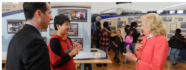
Students from KDES and MSSD came for a special preview of the Museum before the Grand Opening.