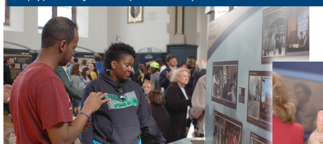
Over 1,000 visitors came to the Grand Opening of the Gallaudet Museum.