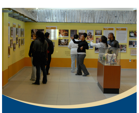
This is the Deaf Peace Corps Exhibition located at the lower level of Market Place at JSAC building at Gallaudet. Click here for more info.