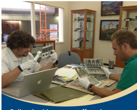
Gallaudet Museum staff analyzes photographs at the Archives.

You're welcome to stop by and visit this unique cottage. If you have any memories or information you want to share about the Gate House, e-mail us at museum@gallaudet.edu.