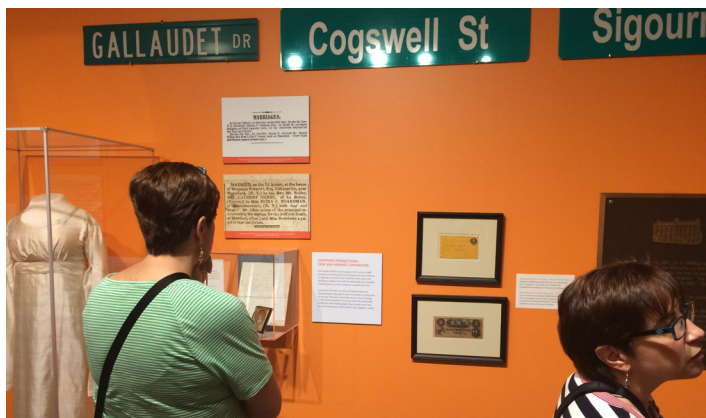
ASD Exhibit at the Connecticut Historical Society.

for six months, and will be shown here for a few months beginning this spring. Keep an eye out for more details, so that you can take a once-a-lifetime chance to see, up close, the stories that impact many of Deaf Americans.