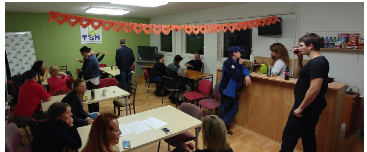
TASPO Deaf Club, Trnava, Slovakia.