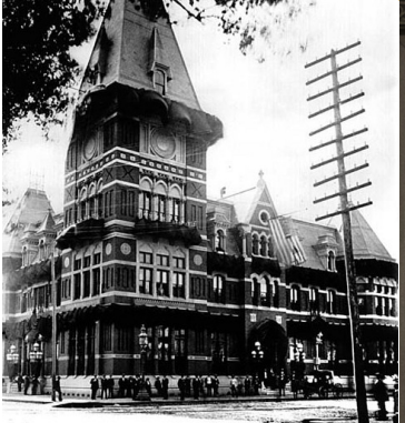
The Baltimore and Potomac Railroad Station, 1881. Location where President Garfield

was shot.