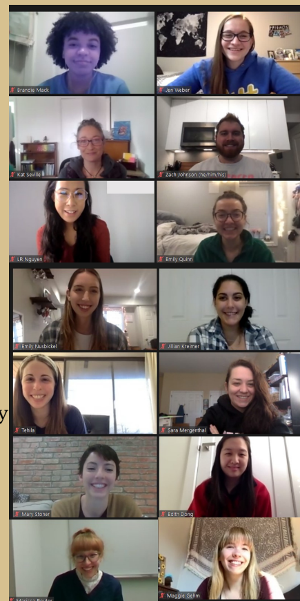
First-Year Au.D. Students