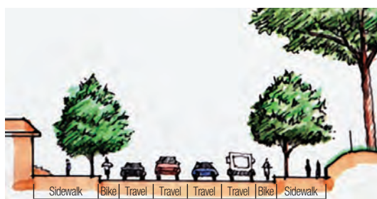
Florida Avenue Section

A redesign of Florida Avenue should consider a reduction of travel lanes to two in each direction, added bike lanes, widened sidewalks, installation of new plantings where possible, and improved crossings. A redesign of the railroad underpass will also be required.